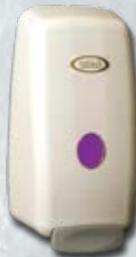
P-1000-C-L-W CleanShot Dispenser 1 L Liquid White w/Whisk Logo