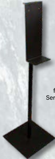
P-1200-DS Dispenser Stand for P-1200-T CleanShot Series Touchless Dispensers