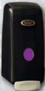
P-1000-C-L-B CleanShot Dispenser 1 L Liquid Black w/Whisk Logo