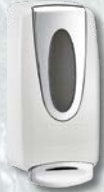
P-1200-C-F-W/C-PL CleanShot Dispenser 1000/1200 mL Foam, White/Chrome