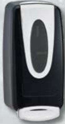
P-1200-C-F-B/C-PL CleanShot Dispenser 1000/1200 mL Foam, Black/Chrome