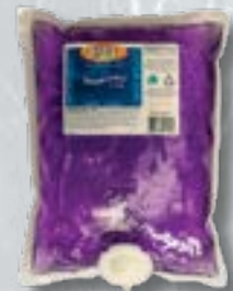
1000 mL Pouch for Liquid Soaps, Lotion and Grit Cleansers