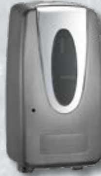
P-1200-T-F-M/C-PL Touchless CleanShot Dispenser 1000/1200 mL Foam, Metallic/Chrome