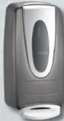
P-1200-C-F-M/C-PL CleanShot Dispenser 1000/1200 mL Foam, Metallic/Chrome