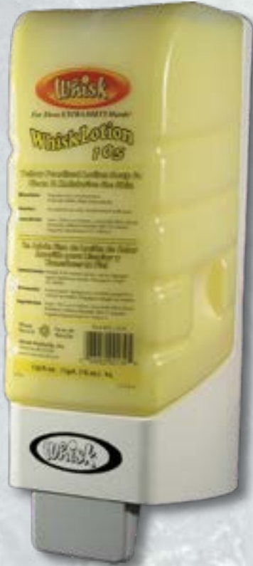
P-400-M A 4 Liter, (4000 mL) dispenser. A larger size for the heavier use areas.