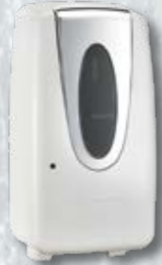
P-1200-T-F-W/C-PL Touchless CleanShot Dispenser 1000/1200 mL Foam, White/Chrome