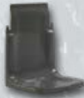
P-1000-DT Drip Tray for P-1000 CleanShot Series Dispensers