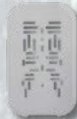
P-1000-WP Wall Mount Plate for P-1000 CleanShot Series Dispensers