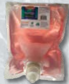
1000 mL Pouch for Foam Soaps and Cleansers