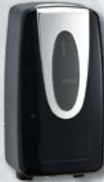
P-1200-T-F-B/C-PL Touchless CleanShot Dispenser 1000/1200 mL Foam, Black/Chrome