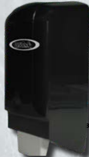
A 1.75 Liter covered dispenser with a key lock. Recommended for use in public areas. Lock can be bypassed for installations not requiring the added security.