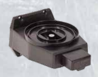
P-450 Pump Dispenser for the 4.5 lb. canister