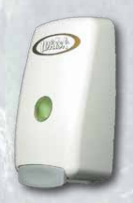
P-1000-C-F-W CleanShot Dispenser 1 L Foam White w/Whisk Logo