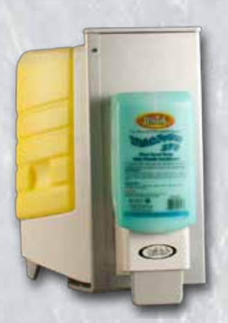
Tri-Sided Bradley Sink Adapter for P-175-K & P-400 Series Dispensers, Non-vented Sinks Only.