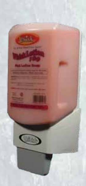
P-175-K-C-B A 1.75 Liter covered dispenser with a key lock. Recommended for use in public areas. Lock can be bypassed for installations not requiring the added security.