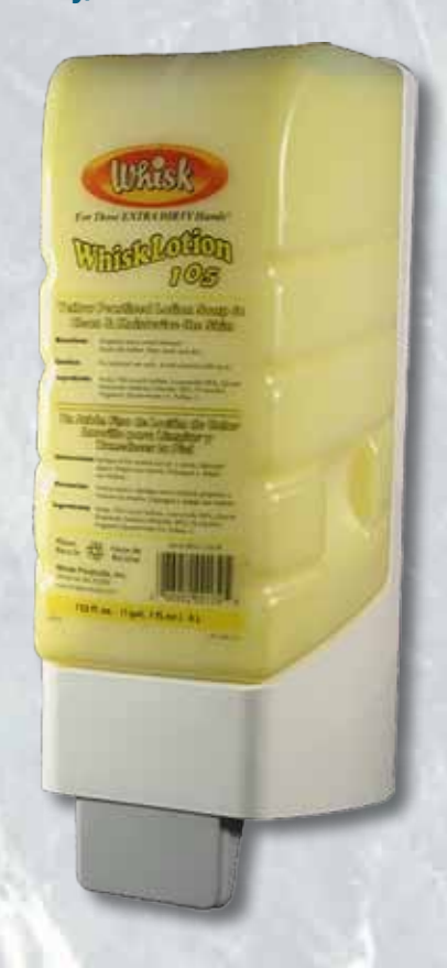
P-400-M A 4 Liter, (4000 mL) dispenser. A larger size for the heavier use areas.

Numerous dispenser options provide the ability to satisfy preferences for capacity, visual indication, security, and automation.