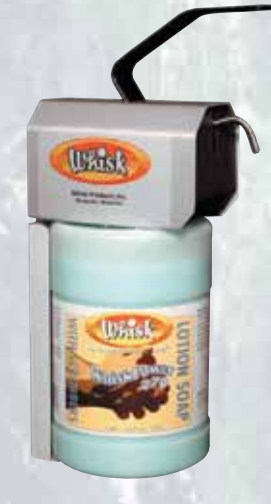
P-128-FT for all Flat Top Bottles. Constructed of Stainless Steel. Safe for Lotion Soap as well as Grit Type Soaps.