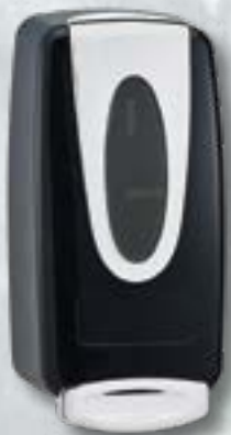
P-1200-C-F-B/C-PL CleanShot Dispenser 1000/1200 mL Foam, Black/Chrome