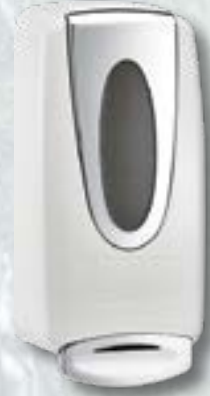
P-1200-C-F-W/C-PL CleanShot Dispenser 1000/1200 mL Foam, White/Chrome