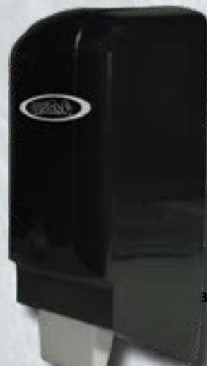
A 1.75 Liter covered dispenser with a key lock. Recommended for use in public areas. Lock can be bypassed for installations not requiring the added security.