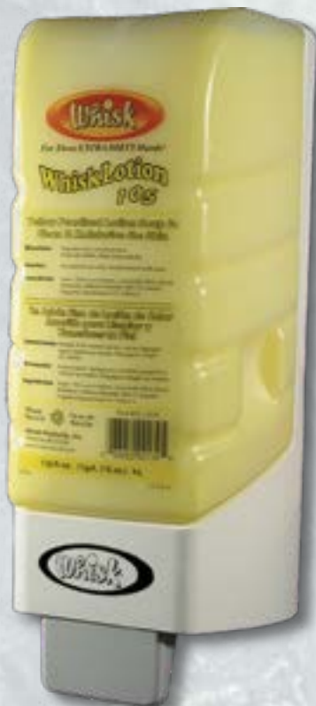
P-400-M A 4 Liter, (4000 mL) dispenser. A larger size for the heavier use areas.