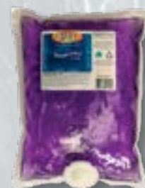
1000 mL Pouch for Liquid Soaps, Lotion and Grit Cleansers