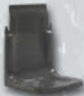
P-1000-DT Drip Tray for P-1000 CleanShot Series Dispensers