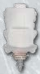
P-1200-C-F-Refill Refillable bottle for Manual, Foam CleanShot 1200 Series dispensers only