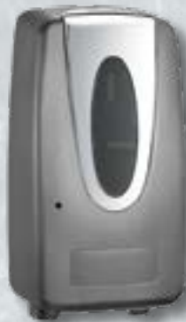
P-1200-T-F-M/C-PL Touchless CleanShot Dispenser 1000/1200 mL Foam, Metallic/Chrome