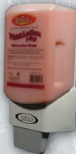
P-175-K A 1.75 Liter dispenser with crisp clean lines for medium use areas.