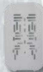
P-1000-WP Wall Mount Plate for P-1000 CleanShot Series Dispensers