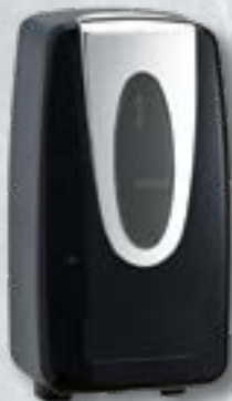
P-1200-T-F-B/C-PL Touchless CleanShot Dispenser 1000/1200 mL Foam, Black/Chrome