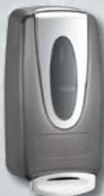
P-1200-C-F-M/C-PL CleanShot Dispenser 1000/1200 mL Foam, Metallic/Chrome