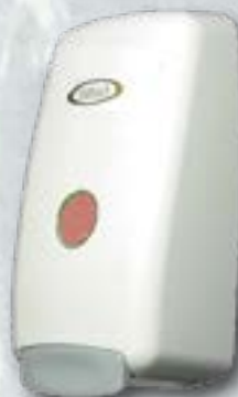
P-1000-C-F-W CleanShot Dispenser 1 L Foam White w/Whisk Logo