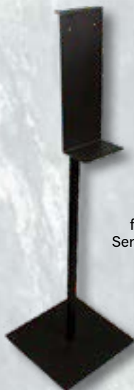
P-1200-DS Dispenser Stand for P-1200-T CleanShot Series Touchless Dispensers