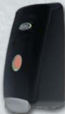
P-1000-C-F-B CleanShot Dispenser 1 L Foam Black w/Whisk Logo