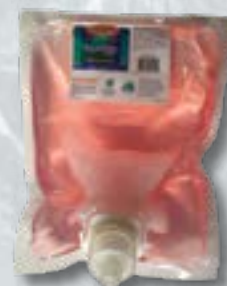
1000 mL Pouch for Foam Soaps and Cleansers