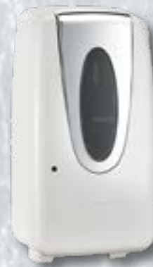
P-1200-T-F-W/C-PL Touchless CleanShot Dispenser 1000/1200 mL Foam, White/Chrome