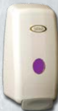
P-1000-C-L-W CleanShot Dispenser 1 L Liquid White w/Whisk Logo