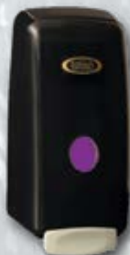
P-1000-C-L-B CleanShot Dispenser 1 L Liquid Black w/Whisk Logo